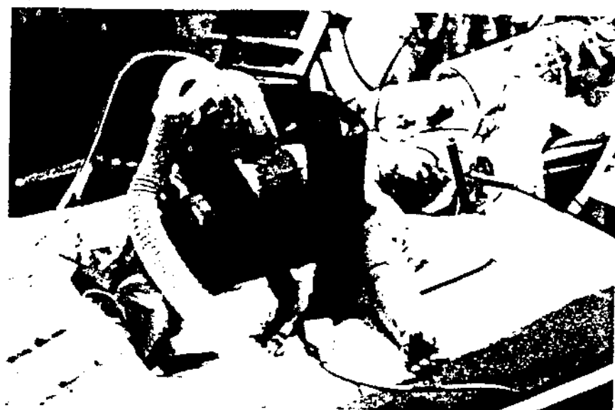
Figure 1 Cuirass negative pressure ventilation in a postoperative patient who was studied four hours after closure of a ventricular septal defect.

or colloid administration during the study period.